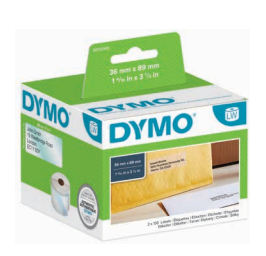
36mm x 89mm 260 labels (2 x 130)