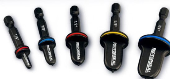
PRO-Fit™ Flare Kit