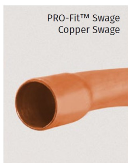
PRO-Fit™ Swage Copper Swage