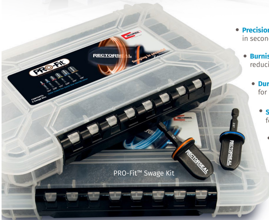
PRO-Fit™ Swage Kit