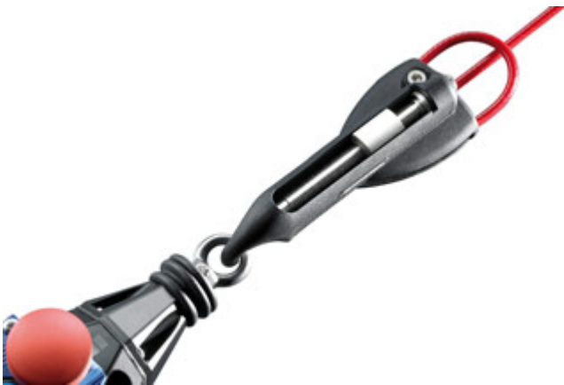
Product in the environment

K.A. Schmersal GmbH & Co. KG, Mödinghofe 30, D-42279 Wuppertal