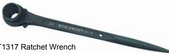
PET1317 Ratchet Wrench