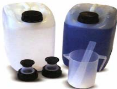
Magic Gel 10000 (10 lt.)

Magic Gel/Fluid is the bicomponent gel for any need: Available in easy to use bags or bottles this non-toxic gel is safe for filling boxes, joints, ducts or traps etc. It has no shelf life, is re-enterable even after long working periods and has an IP68 rating. Simply mix the two fluids together with ratio 1:1, pour over terminal and the gel sets in 10 minutes.