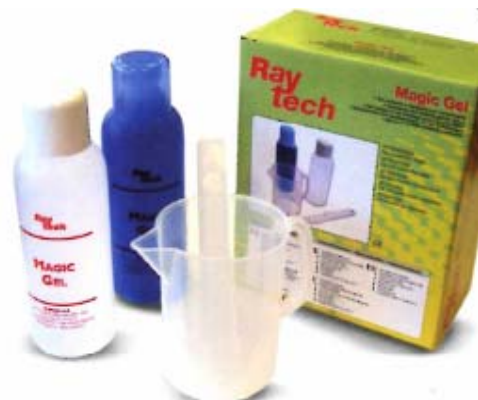
Magic Gel (1 lt.)