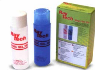
Magic Gel 300 (300 cc.)