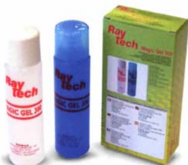
Magic Gel 300 (300 cc.)