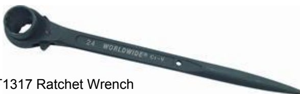
PET1317 Ratchet Wrench